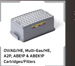
OV/AG/HE, Multi-Gas/HE, A2P, ABE1P & ABEK1P Cartridges/Filters

HEPA cartridge/filter - removes up to 99.97% of particulates down to 0.12 microns. Gas cartridges/filters protects against organic vapor exposure. Replace the pre-filter daily to extend the life of the main cartridge/filter.