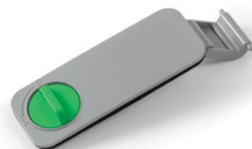
Battery Door Assembly (includes 03-818) Part # 03-815