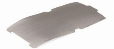
Spark Arrestor Part # 03-891