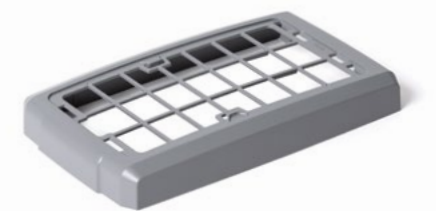
HEPA Cartridge/Filter Door Part # 03-813