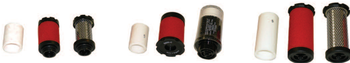
BB30 Series Filters