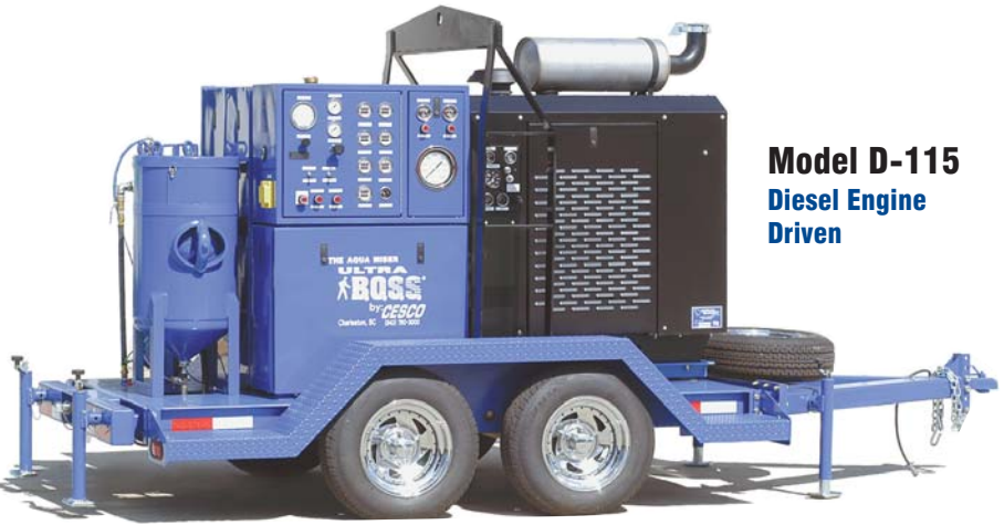
Model D-115 Diesel Engine Driven

Low Maintenance Ultra High Pressure Pump Abrasive Injection to Enhance Strip Rates (optional) Remote Start/Stop Pump Control Small Compact Modular Design - The E-75 requires minimal floor space and allows the abrasive section to be placed away from the pump.