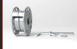
MBX Adapter System USAS-009-23 23 mm width

Made of high quality die cast aluminium, with safety elements