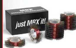
MBX Bristle Blaster Set USBU-110-23 Carbon Steel 23 mm width USBU-160-23 Stainless Steel 23 mm width

0.7 mm spring steel angled, ground and heat treated tips, OD:115mm 0.7mm surgical spring steel, ground tips, OD:115mm