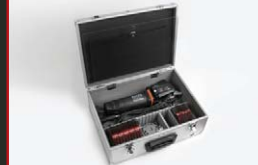
MBX Bristle Blaster Set USSE-06-02 Electric

The MBX System combines ease of use, superior performance and safety of operation in a versatile tool that handles a wide variety of surface preparation tasks.