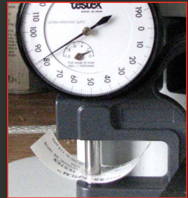
• 83 R 2 (3.3 mil)