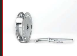
MBX Adapter System USAS-009-11 11 mm width

0.7 mm spring steel angled, ground and heat treated tips, OD:115mm 0.7mm surgical spring steel, ground tips, OD:115mm