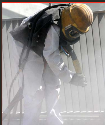
Conventional Grit Blasting