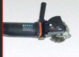
MBX Blaster Electric USSE-06

Free Speed: 3,500 rpm Required Air Pressure: 90 psi Average Air Consumption: 4 cfm Interior Air Hose Size: 3/8" Weight: 2.4 lbs Warranty: 6 months