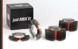
MBX Bristle Blaster Set USBU-110-11 Carbon Steel 11 mm width USBU-160-11 Stainless Steel 11 mm width

Free Speed: 3,200 rpm Voltage Rating: 120 v +/- 10% Amperes: 4 amps Weight: 4.0 pounds Warranty: 6 months