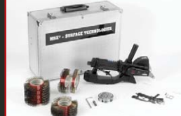
MBX Bristle Blaster Set USSP-06-02 Pneumatic

Made of high quality die cast aluminium, with safety elements