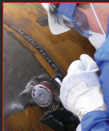
Newly Developed Bristle Blaster