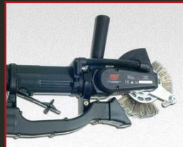
MBX Blaster Pneumatic USSP-06

Free Speed: 3,500 rpm Required Air Pressure: 90 psi Average Air Consumption: 4 cfm Interior Air Hose Size: 3/8" Weight: 2.4 lbs Warranty: 6 months