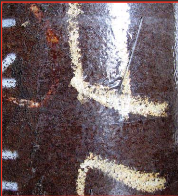
API 5L Piping